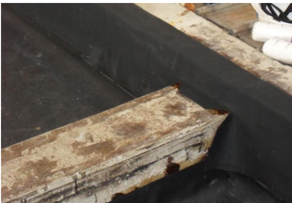
Detail Work on Bund Wall