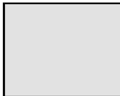
Pastel Grey, N12