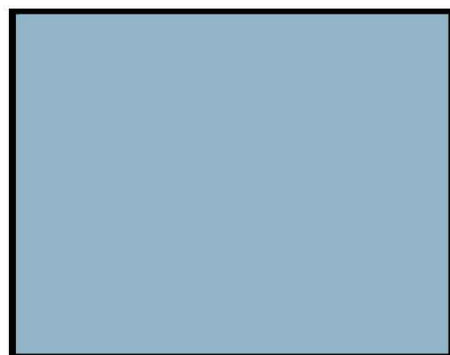
Blue Grey, N53