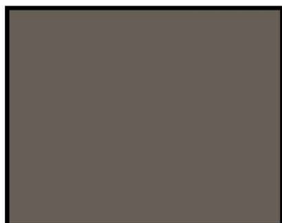
Dark Grey, N64

Poly-Tech welcomes the opportunity to provide sound, practical advice and effective solutions for the repair and protection of concrete floors against the corrosive effects associated with all forms of industry.